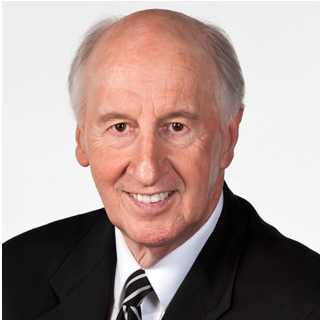
Pastor Jack Hayford , Church on the Way, CA

"The 27 Minute Bible is a masterpiece of entertainment!"