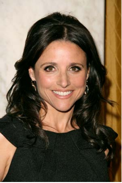
Julia Louise Dreyfus , Actress, "Old Christine"