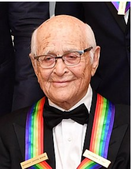
Norman Lear , TV Statesman and Producer of "One Day At A Time"