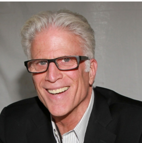
Ted Danson , Actor, "Becker"

"I don't know how you do it, but you're just fantastic."